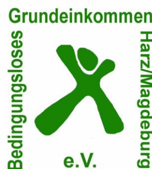
Association Unconditional Basic Income Harz/Magdeburg, Germany