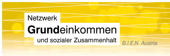
Network Basic Income and Social Cohesion – B.I.E.N. Austria