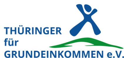
Thuringian for Basic Income, Germany