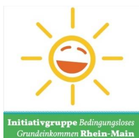
Initiative Group Unconditional Basic Income Rhein-Main, Germany